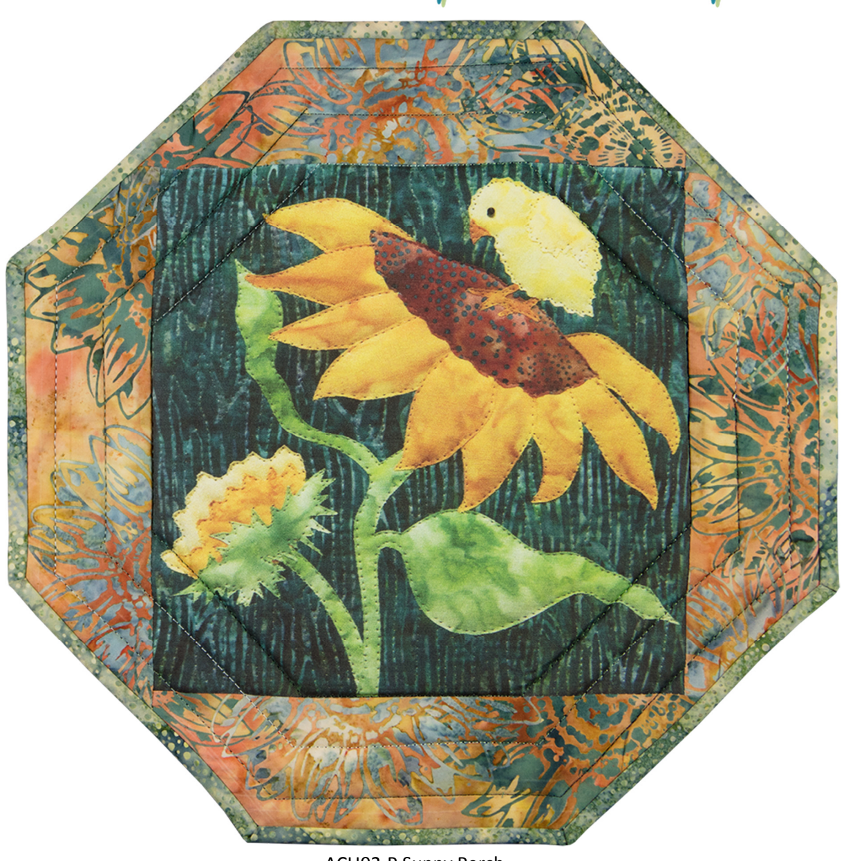
ACU02-P Sunny Perch